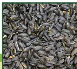
Black Oil Sunflower